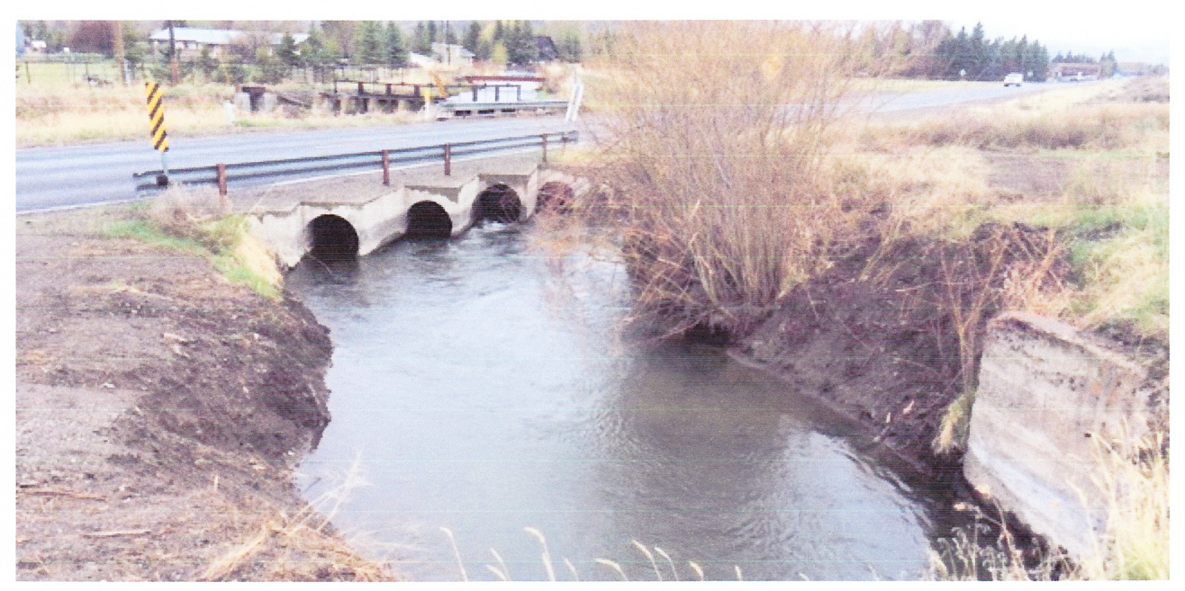
Top of the East Lateral where it passes under Gannet Road Some will question why I had the ditch and ROW cleaned, but left some willows. My reason: to provide protection to keep the bank from continually sloughing off and eroding; to provide a marker for the otherwise invisible precipice for passing motorists; and, well, at least a little bit of continued nesting opportunity for the little birds!