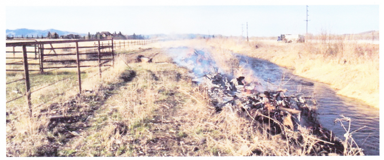
Old slash cleanup near top of 75 Where Intermountain Gas buried the long exposed remnant of piped gas line, last Fall. This length of ROW is now readily mowable.

It looks better too, but we will have to follow up with removal of the resultant regrowth.