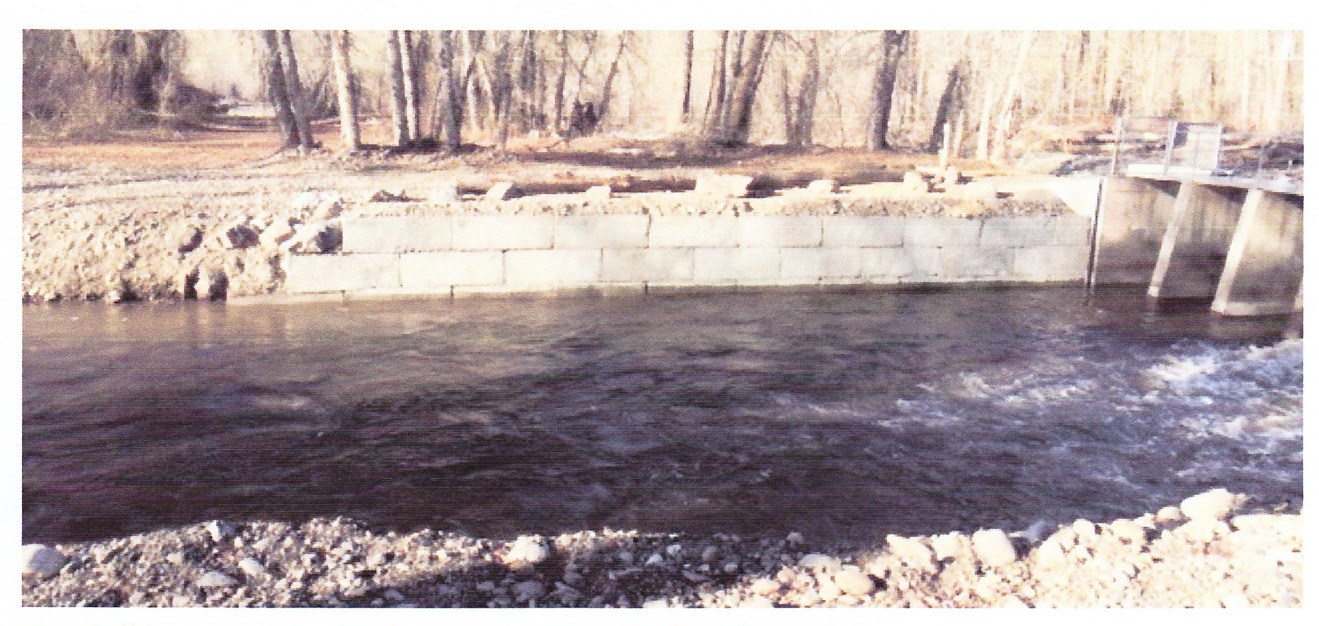
Our Fall improvement in The Preserve Just below the Mains

Any questions or ideas, don't hesitate to call or stop by, where ever you see me, out there.