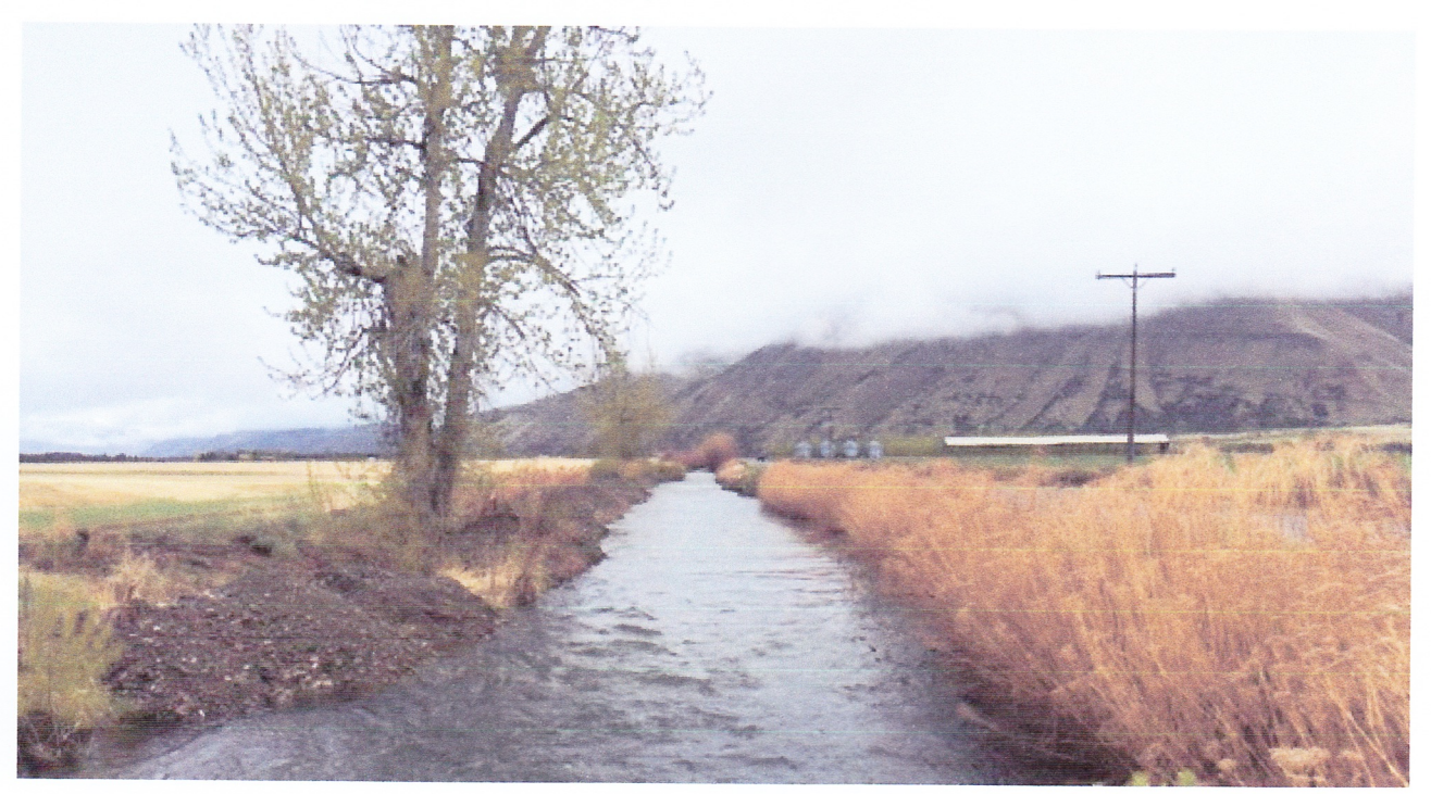
Last day of large volume gravel removal Early April and then, yesterday. Upper Kingsbury. Donated equipment.