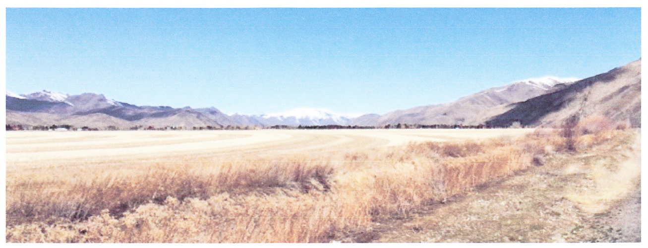
April 2 One of those early season, cold days, on my summer job, split between my last few days of my winter work on Baldy.