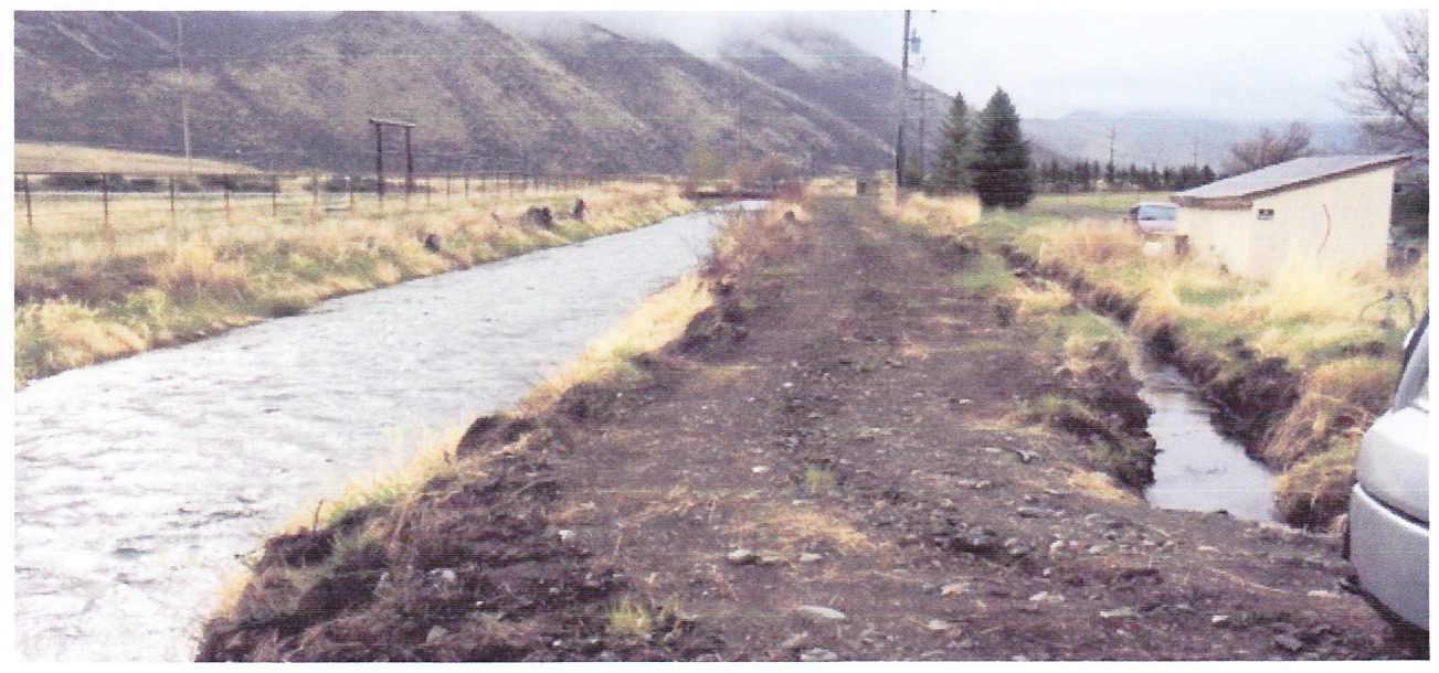
Right of Way clean up just below Ed's Drop at Matt Thornton's We doubled the amount of easily accessible bank on this stretch, which will make any nearby maintenance much easier.