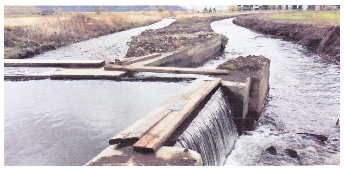
This is a reconstructed fork just north of Greg Anderson's house on Pero Road We are still learning how to manage the new flow thru here to various destinations, and struggling with unstable bank conditions.