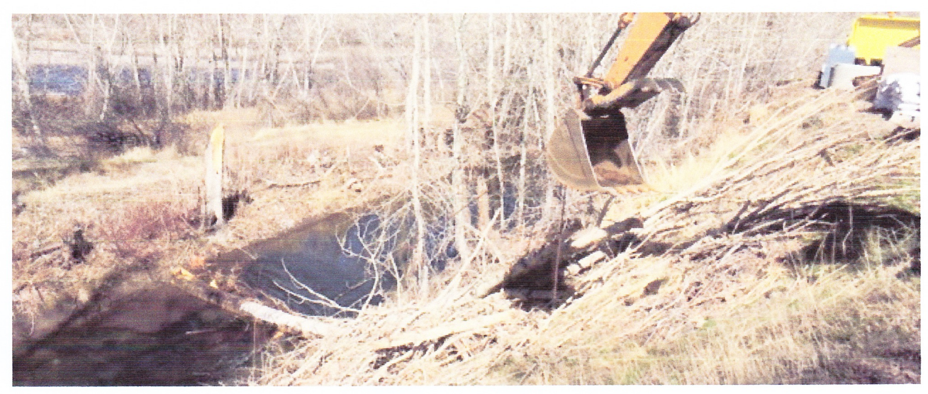
...and the resultant large tree down into the Upper Canal Luckily, this was right out Keith's backdoor! All he had to do was start his engine, practically.

One of our last-minute efforts, before allowing water into the canal, was to bring Alpine Tree Service in to the Upper Canal and Preserve, to remove several monstrous Cottonwoods that we felt presented too much risk of falling, either into the canal or onto neighbor's fences. This was work that was started last Fall, but was added into the current budget, for continuation. It has made significant improvements to safety and maintenance thru out the system, due to a large reduction in deadfall and debris needing to be pulled from the water.