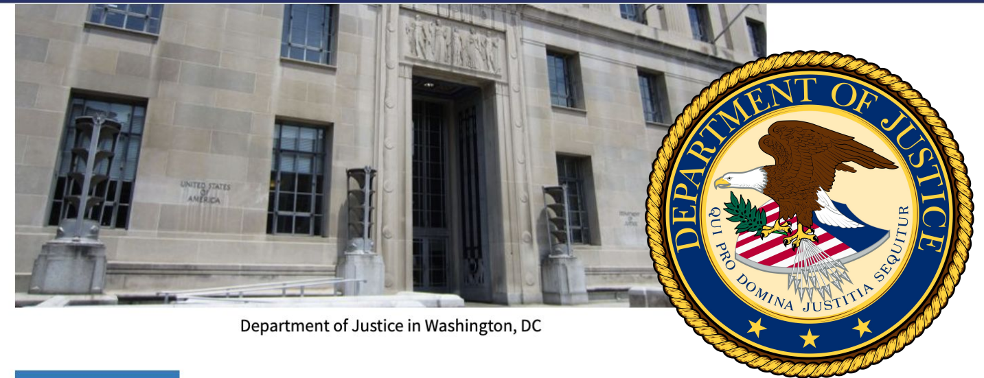
Department of Justice in Washington, DC