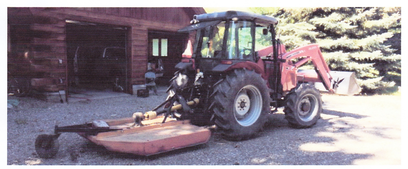
June 1 I will be renting this combination by the hour.

May 27 Lots of lightning and hail kept us all wet even when out of the Ditch, for several days. Needless to say, no calls for water for over a week!