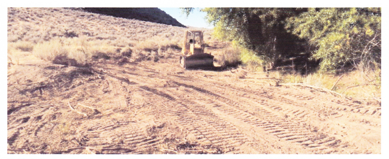
Keith is back in town after fighting fire in far flung places around the West. This is a section of our East canal, over on the Cove Ranch (TID), which hasn't been accessible by vehicle in years, due to brush and willows.

We have several sections, in various locations, where Keith will be working, this Fall.