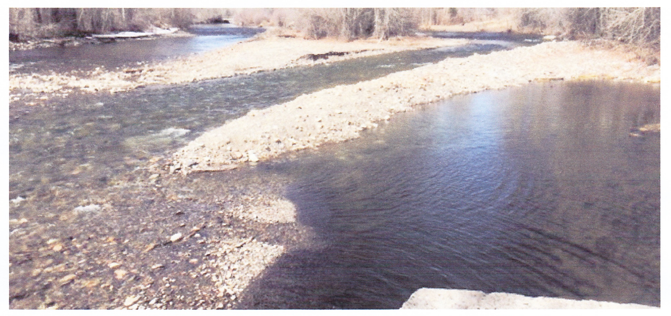
The remnant of our "in-river" coffer dam, built last Fall to dry out our Main Headgate. It served us well, and was only breached after two inches of rain fell last week.