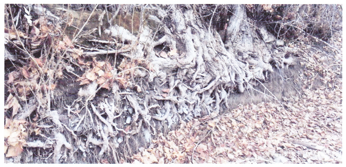
Tree roots that armor the steep banks along the upper canal sections.

They also suck up water, as everyone knows.