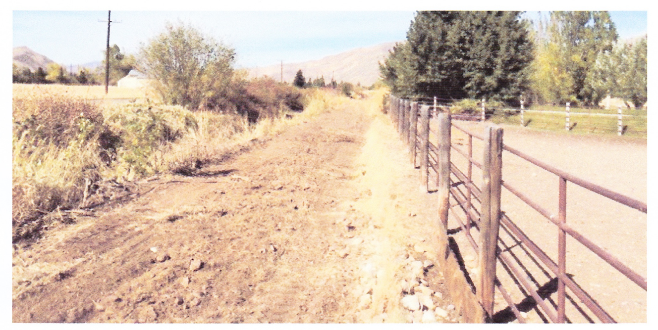
Same length of ROW.

Some of these places are very narrow. Keith is removing the shrubs and overgrowth with a mini excavator and hauling to areas nearby where we can safely pile and burn it.