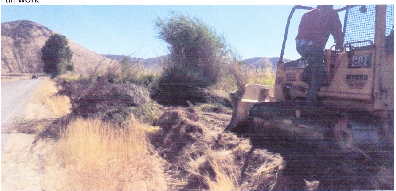
Keith removing willows both from inside and along side the canal. South side of Pero Road. (TID)