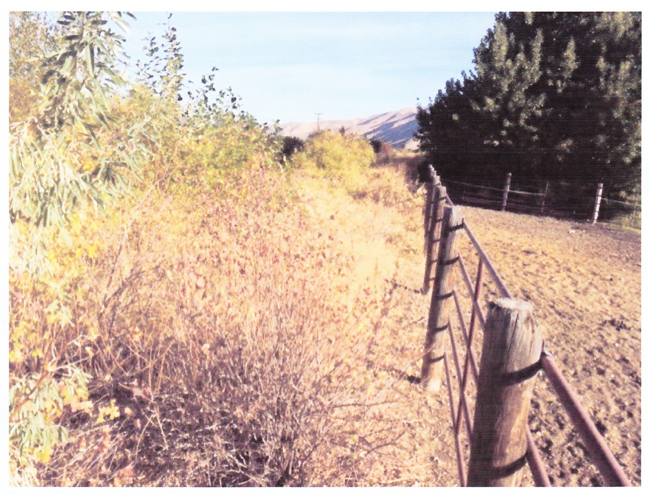
ROW along east side of Canal 75, just north of Glendale Road.

The end result is very beneficial for monitoring and cleaning the canal during the irrigation season, plus we'll be able to mow here now, and no longer need to do regular burning or spraying.